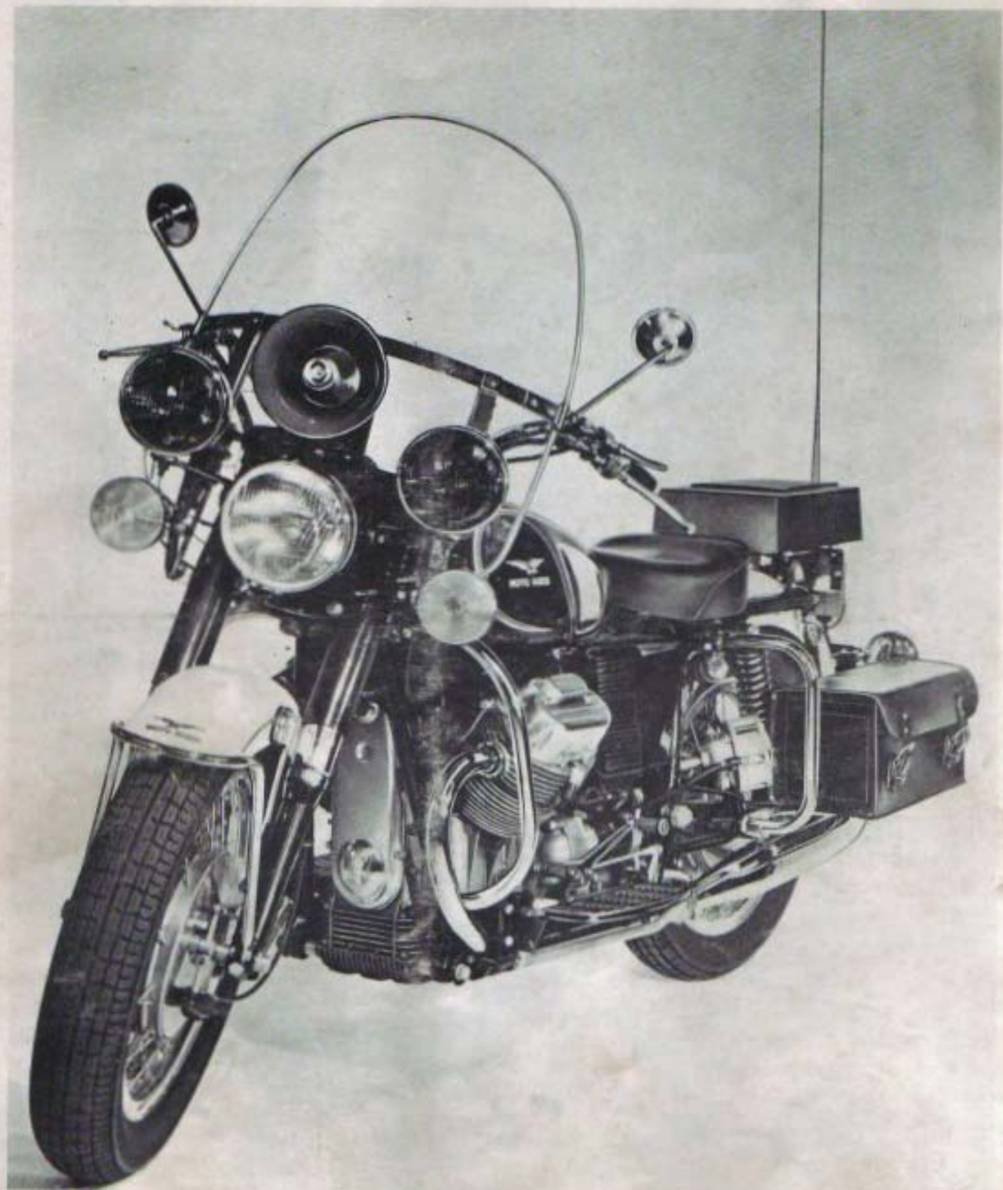
850 POLICE SPECIAL — Dependable mobility for patrol, escort or pursuit.